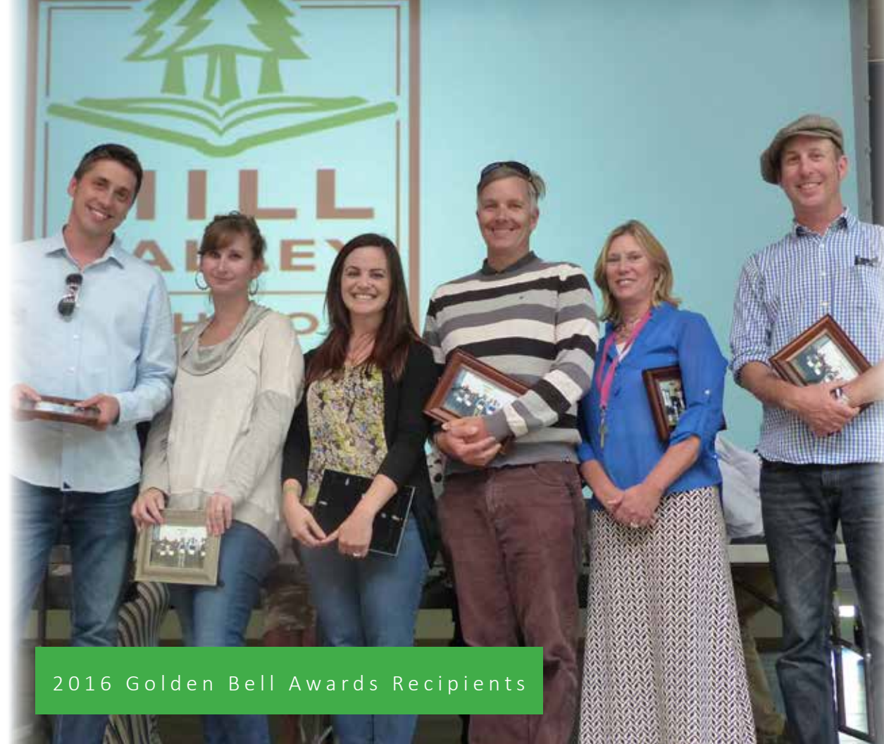
2016 Golden Bell Awards Recipients

Staff share-outs, such as at staff meetings, during learning walks.